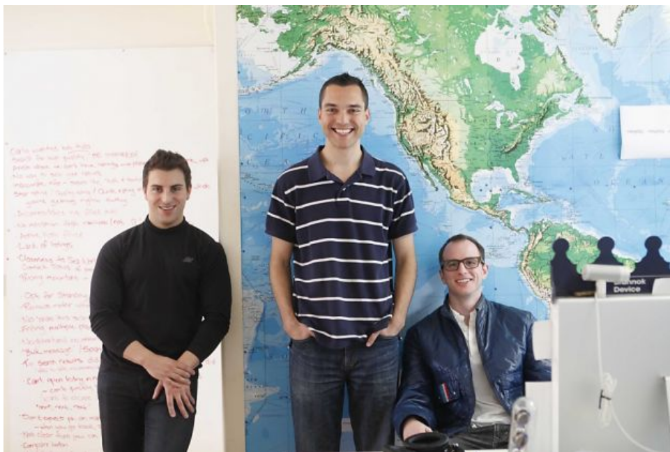
The co-founders of airbnb, Brian Chesky Nathan Blecharczyk and Joe Gebbia stand for a portrait in the SOMA headquarters on Tuesday March 16, 2010 in San Francisco, Calif. Their company provides an online listing for regular people looking to rent their couch or a spare room to travelers.